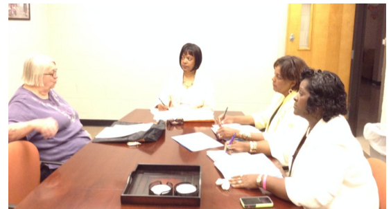
ALASGW Executive Board on September 26th, 2015 — Hard at work!