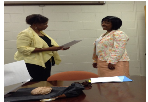
ALASGW Executive Board at June 6th, 2015 — first meeting.